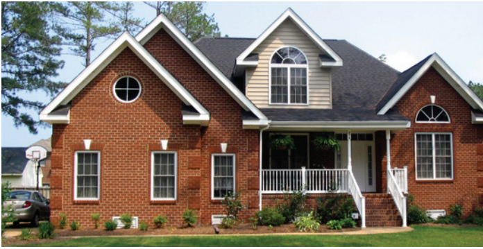
Elevated home on crawl space foundation

If a community does not adopt new floodplain management regulations or amend its existing regulations before the effective date of the flood map, the community will be suspended from the NFIP.