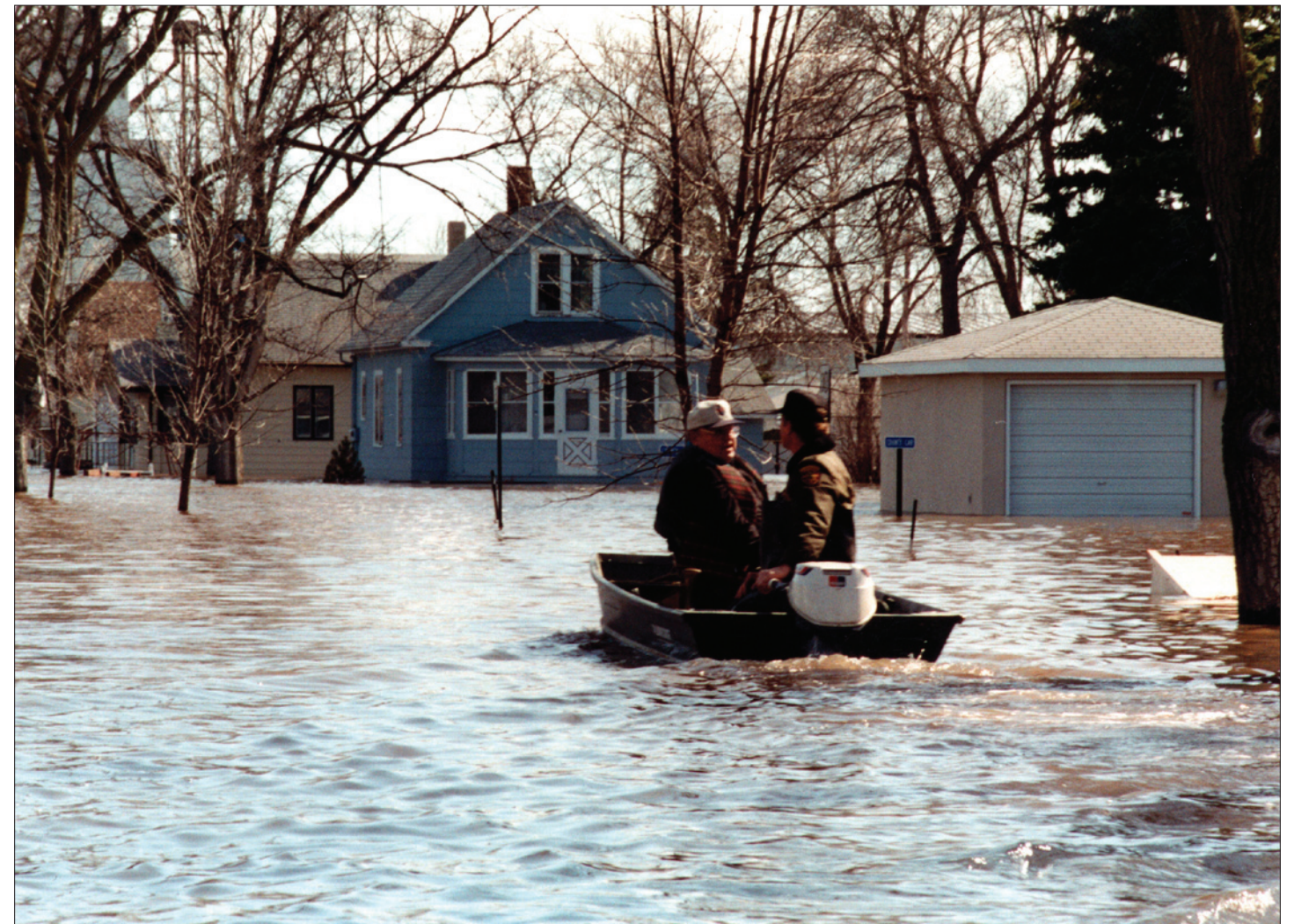
Breckenridge, Minnesota, 1997

community must adopt based on the type of flood hazard data provided to the community.