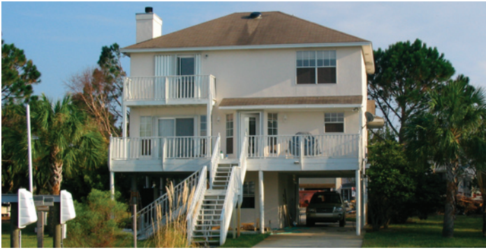
Elevated home on pile foundation