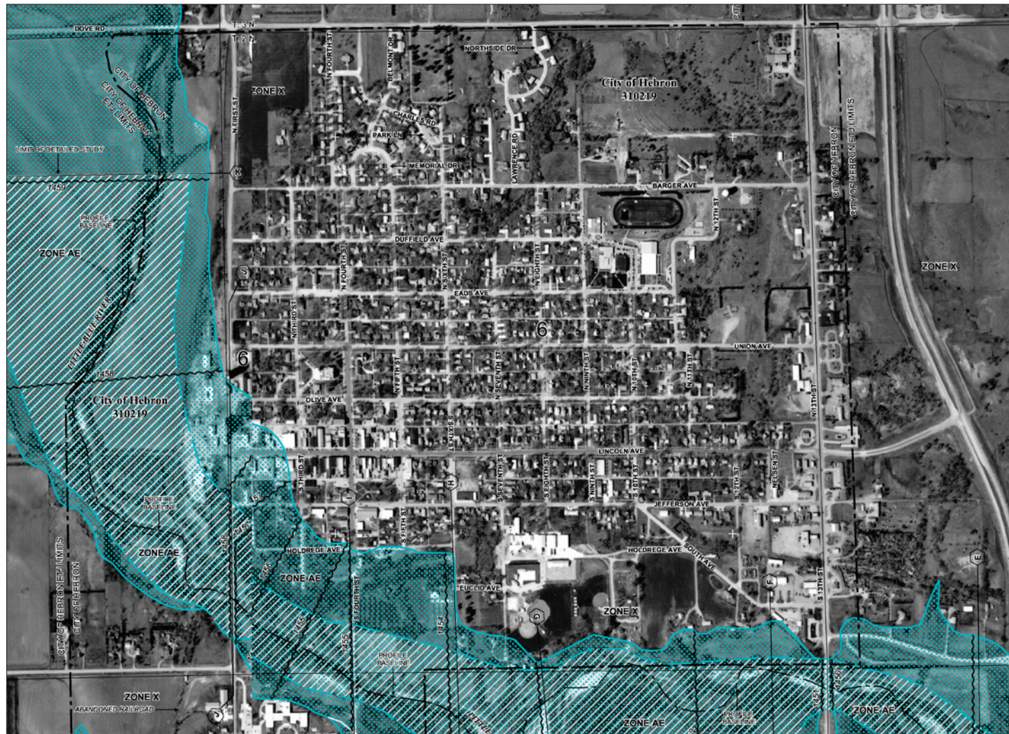
Digital Flood Map

agencies are participating with FEMA in developing and updating flood maps. (See the box on the inside of the back cover page for a brief description of the CTP program.)